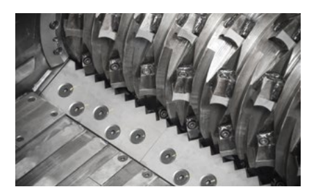
Sharp cuts guaranteed thanks to adjustable counter knives

Individual hopper extensions and enclosures with plastic curtains are available to prevent materials from being thrown from the hopper. In the heavy duty version, the feed hopper is double-walled and thus effectively contributes to sound insulation.