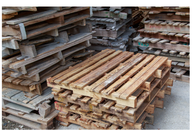
The Woodwolf is the ideal WEIMA machine for shredding pallets.